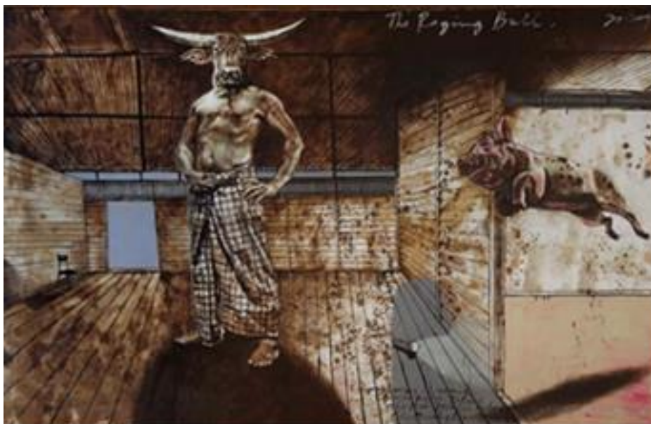
Fig. 1.3: The Raging Bull, 2015.

Efforts to further improve the guidelines in detail are an integral effort in the current visual art scene. This has to be done to prevent Malaysian visual art artists, generally and Muslims specifically from breaching the Islamic Shariah laws in future production of their artwork. Malaysia as an Islamic country has to improve the existing guideline with regard to visual art and others too according to current demands.