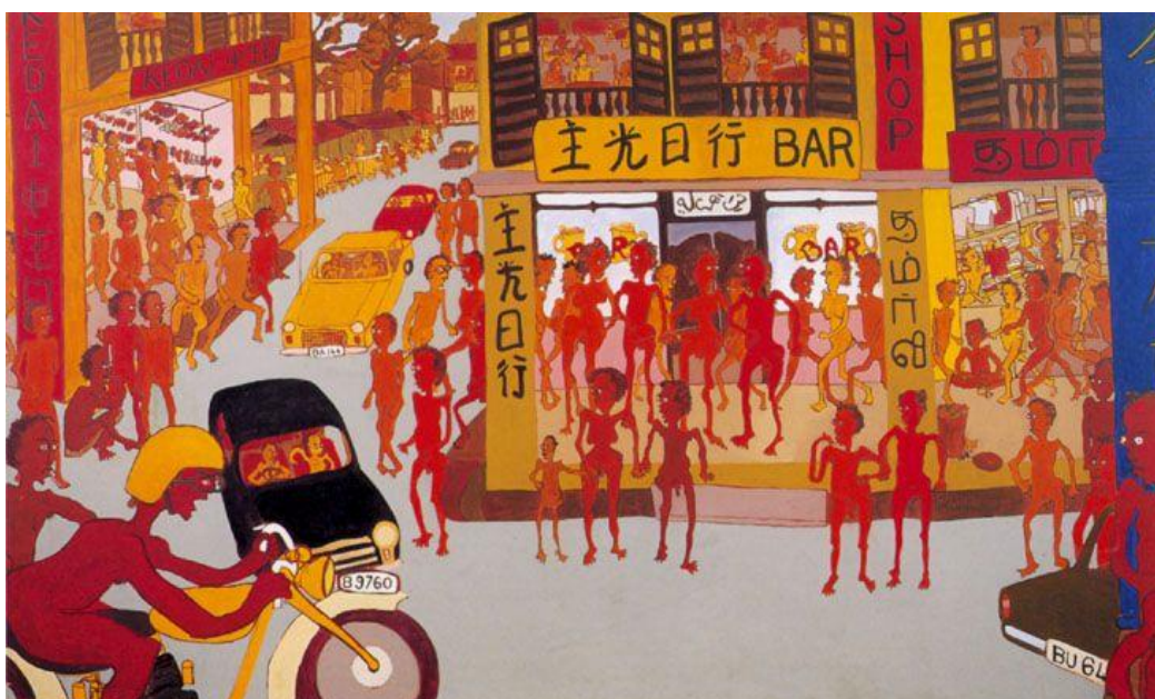
Fig. 1.1: Kedai-kedai, 1973.

Generally, in Malaysia, many artists often produce artwork in the Western visual language. Malaysian education during its post-independence years transformed from the traditional or madrasah and vernacular system to modern education from the West. As a result, many local students went to pursue their studies abroad to obtain formal education from the foreign countries. One of the fields which was part of the main choice of education in the West was visual art field. This situation was apparent when there was scholarship offered from the state governments and various foreign scholarships for those who were interested to take up visual art studies. Malaysian artists who received formal education from the west through scholarship were Sulaiman Esa, Syed Ahmad Jamal and Redza Piyadasa (only to name a few). As a result, changes in the visual art movement in Malaysia could be seen in the artwork style which used Western visual language (Mulyadi Mahamood, 1993). Nevertheless, the Malaysian visual art scene suffered a conflict when there were some artwork exhibited clearly contrasted with the local society's visual culture. Such situation occurred among the Malaysian visual art scene because it was still in the process of assimilation or adoption of Western visual culture into their artwork.