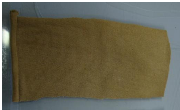
Figure 4. Dyed fabric specimen