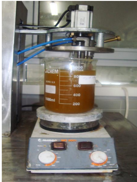
Figure 2. Dyeing Machine

After checking the cleanliness of the thermal dyeing machine, the dyeing containers are made ready. The fabric specimens are put into the prepared test containers, and 100 ml of each aqueous solution prepared for dyeing is placed into the test containers. The test containers are placed in the machine and treated at 90°C for 60 minutes. After the dyeing process is completed, the dyed cotton fabrics are taken out and ventilated for some time. Then, they are rinsed with cold water, spread onto the drying paper and placed into the drier. The specimens are treated for 15–20 minutes at 60°C, after which they are taken out and ventilated.