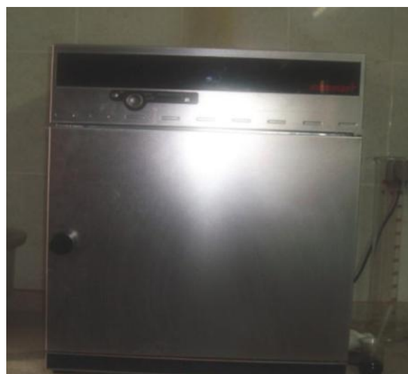
Figure 3. Drier