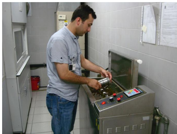
Figure 1. Solution and magnetic stirrer

In the pre-mordanting process, on the other hand, each specimen was treated with only mordants at 90°C for 60 minutes, after which the dyeing process was carried out. Each prepared solution was stirred for 30 minutes using a magnetic stirrer and the pH values were measured. These measurements are given in the dyeing recipes.