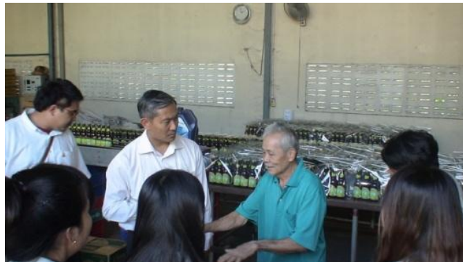
Fig. 3. Environment working Areas

Are you exposed to high heat from the machine? , 3) Are you exposed to strong smell in the workplace? , 4) Are you exposed to chemical in the workplace? , and 5) Are you exposed to bright light in the workplace? The overall mean was 3.01 with 0.98 of standard deviation.