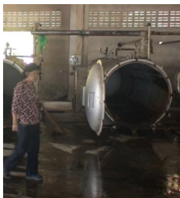
Fig. 4. Boiler Maintenance

Table 4 shows means and standard deviations of four variables or categories. The means values can help to rank these variables from high to low as follows: 1) Did you wear protective gear? , 2) Did you follow the rules and process of working? , 3) Did you inform your supervisor of any broken machine? , 4) Did you inform your supervisor of any sickness from work? , 5) Did you receive any training on dust, noise, light and strong smell? , 6) Did you horse-play during work? , and 7) Did you wear proper uniform? The overall mean was 3.45 with 0.91 of standard deviation.