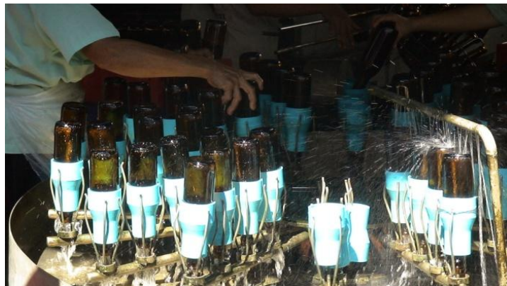
Fig. 1. Working Areas Process

Table 1 shows means and standard deviations of four variables or categories. The means values can help to rank these variables from high to low as follows: 1) Signs and warning with pictures, 2) Dirty floor and some obstacles on the floor, 3) Unorganized inventory and misplaced items, and 4) Unmarked space and stack up inventory too high. The overall mean was 3.16 with 0.90 of standard deviation.