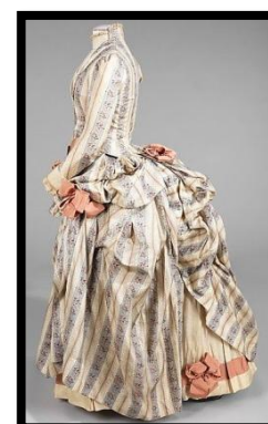
Picture.12. The period of time from 1875 AD till the end of this period

To answer the first question in the analysis of the style of women's fashion in this period, picture (12) illustrates that the bodice was knitted from the front and the back with the variety in the tight aperture of the chest with collars or not, the sleeves were tight till the wrist and ends with cornices or pleats. As for the waist line, it was tight in the natural waist line. The skirt had a long tail at the back made from multiple types of fabrics and it was folded on the bottom part with beautiful folds and that was called the ties backs style i.e. the tie backs fashion.