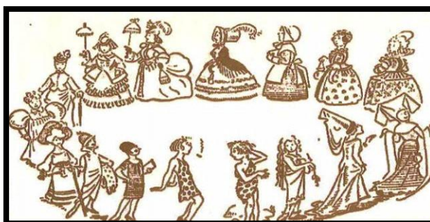
Picture .17. The cycle of the concept of modesty throughout the eras.

The clothing fashion of women took a different curve that gave different meanings of liberation, women going out to work and the increased number of the population. This was reflected on the areas of houses that have become less spacious in addition to the tendency of women to wear light weighted clothing to give her ease of movement through light clothing consisting of a single layer and to consider modesty as a way to cover only parts of the genitalia. This was confirmed by what is stated in the book "Is History lying", picture (17), which is about the concept of modesty that passed over the natural curve through the ages until it reached the form of modesty in the Stone Age [26].