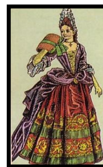
Picture.4. The period of time starting from 1675 until the end of the period

To answer the first question in the analysis of women's fashion style in this period, picture (4) illustrates that bodice was a solid knitted garment worn over the corset and tipped from the front and ends at the natural waist line and the round or square aperture of the neck that does not reveal the chest. The collars are small made of light fabrics. As for the sleeves, they are knit to the elbows and ends with a cuff with several round folds overlapping with each other or the use of "Amadis sleeve" which is a long sleeve linked with it narrow cuffs with buttons. As for the skirt, it is divided into two; the gown is long with a long tail from the back and from the front it is opened and called mantua. Sometimes, its edges are combined to the back and the lower skirt appears.