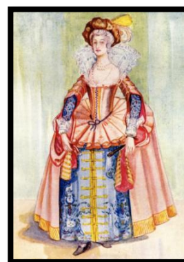
Picture.1. The period of time 1600 AD- 1625 AD

To answer the first question in the analysis of the style of women's fashion in this period, picture (1) illustrates that the bodice is tight; the waist line is in its natural place with a round in the front triangle of the bodice. Fashionable bodices had high neck lines or extremely low, the collar was round called the cart-wheel as it was made from reinforced fabrics by a wire to lift it from the shoulders. As for the sleeve, it takes the form of the tight leg of the mutton which ends with ruffles in addition to having another upper sleeve suspended. For the skirt, it was divided into two, the upper one was named "Gown" and it is open from the front and the lower skirt was named "petticoat" and its length is up to ground level and the women wore underneath it the farthingale that is similar to the Cart-wheel farthingale".