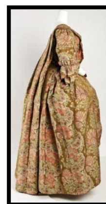
Picture.8. The period of time from 1775 AD till the end of this period

The corsage was tailored together with the external skirt and it had deep pleating on the shoulder and underneath it there was a lining from the same fabric that is draped along the back making a short tail to the ground. As for the front triangle of the bodice, its base is down, its top at the chest and has a low chest décolleté. Regarding the collars, they are from the same fabrics as the dress or the lace or both of them, the sleeves are puffy and extended till the bottom of the enclosure. Under the internal skirt, a circular hoop was worn.